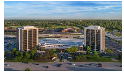
2 multi-story Class A office buildings joined by a retail concourse

WHEN EVERYTHING YOU LOVE ABOUT DOWNTOWN AMENITIES IS PAIRED WITH EVERYTHING YOU WANT IN A SUBURBAN OFFICE OAK BROOK REGENCY TOWERS